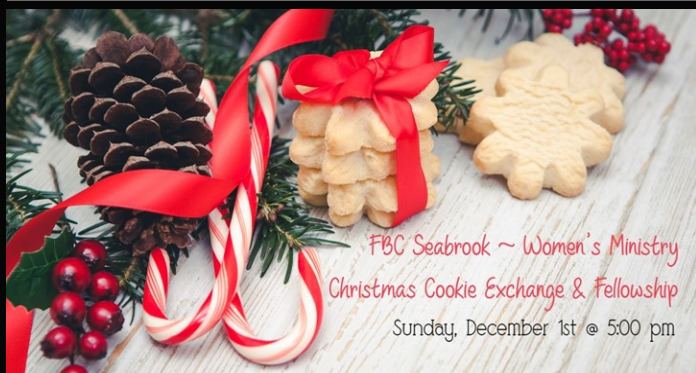
FBC Seabrook ~ Women’s Ministry Christmas Cookie Exchange & Fellowship Sunday, December 1st @ 5:00 pm

We will all gather together for one service, which means there will be no Children’s or Pre-K church and no Youth Sunday School. The nursery will be open for children ages 0-3, but all other children will get to stay with their parents for these special morning services.